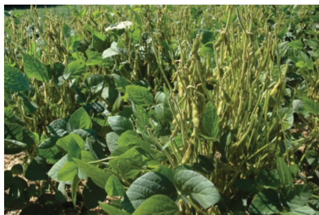
Warm-season forage plots, such as these soybeans, can provide an excellent source of protein (leaves) during summer and an energy source (beans) in winter.