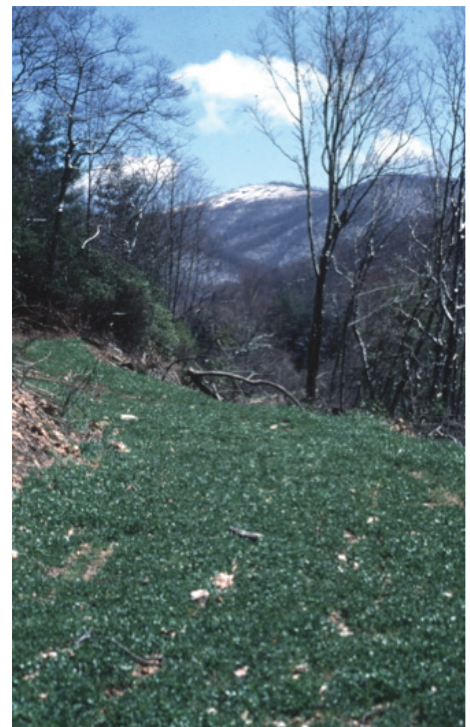
Forest roads, such as this one planted to clovers, provide nutritious forage as well as travel corridors for various wildlife species.