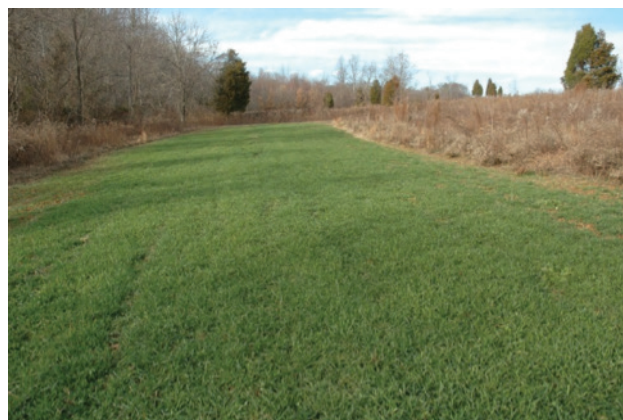
Cool-season food plots provide nutritious forage fall through spring when availability of naturally occurring forages may be relatively low. Depending on what is planted, such as this winter wheat, a nutritious seed source also is available the following late spring through summer.