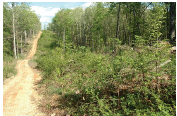
This forest road was daylighted to provide additional browse, soft mast, and nesting cover for various wildlife species. The road was graveled to prevent erosion because it receives considerable traffic from land managers.