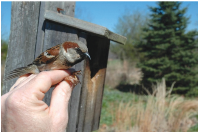
House sparrows often displace bluebirds from nest boxes constructed for bluebirds. This invasive nonnative species should be removed whenever possible.

Although not common, Wildlife Damage Management Techniques also could be required if increased harvest has not been effective. Situations can occur where local regulated hunting and trapping pressure is not able to effectively lower a population and professional wildlife damage management specialists are needed to address the situation. Examples may include population reduction for white-tailed deer, raccoon, coyote, and American beaver. The person in charge of the contest will give you clues as to which WMP ( Increase Harvest or Wildlife Damage Management Techniques ) would be most appropriate.