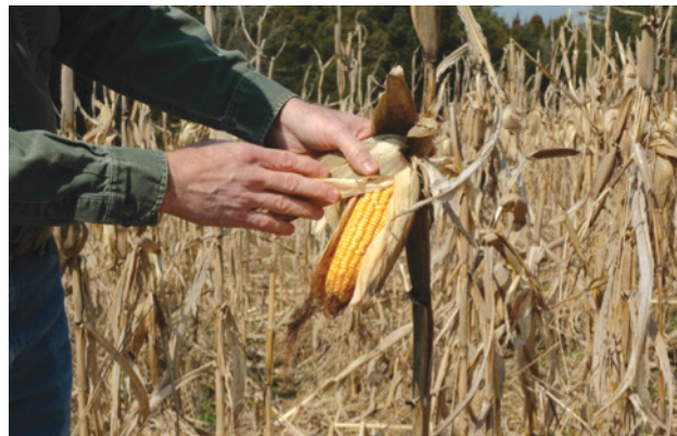
Warm-season grain plots, such as this corn, can provide an important source of energy through winter for many wildlife species.