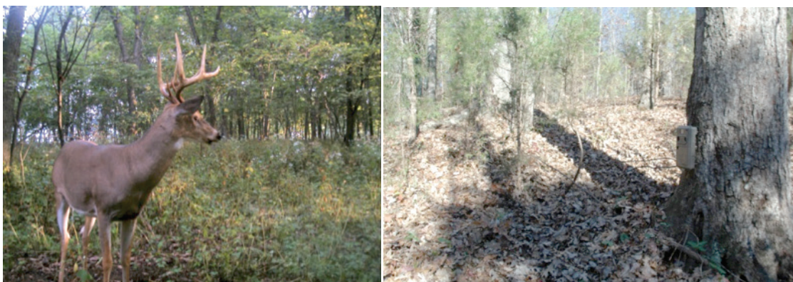
Infrared-triggered cameras are a great tool to survey populations of several wildlife species.

Pond balance should be checked during early summer by seining at intervals around the pond. Balance is determined by comparing age groups, condition, and numbers of bass and bluegill caught in the seine during