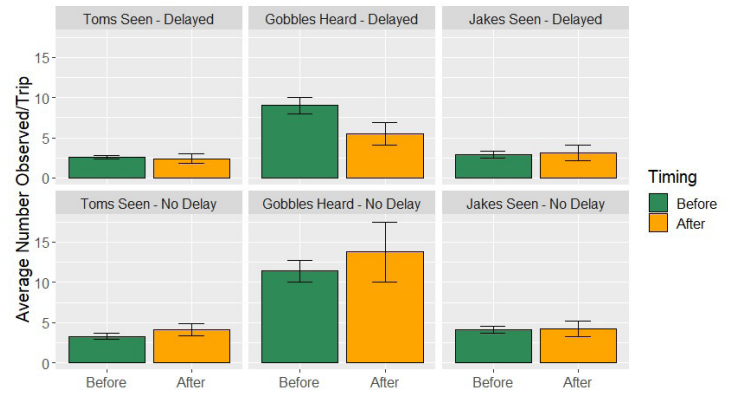
Figure 2. Experiential metrics (number of toms seen per trip, gobbles heard per trip, and jakes seen per trip) by wild turkey hunters during spring hunting season in south-middle Tennessee county groups with and without season delays, before (2017–2020) and after (2021–2022) delays were implemented. Error bars represent 95% confidence intervals.

Hunter satisfaction was not correlated with hunter effort but was positively correlated with hunter success, hunter efficiency, and all experiential metrics (Table 3). We documented negligible support for the relationship between hunter effort and satisfaction